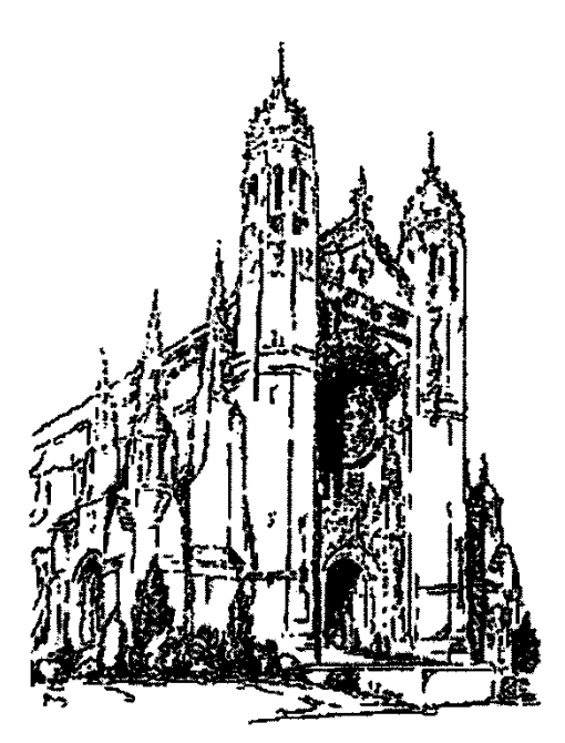
Our Lady, Queen of the Most Holy Rosary Cathedral