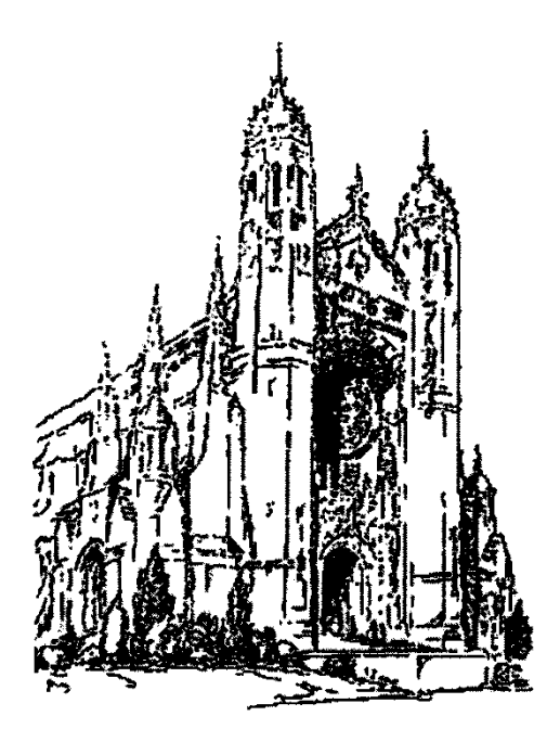
Our Lady, Queen of the Most Holy Rosary Cathedral