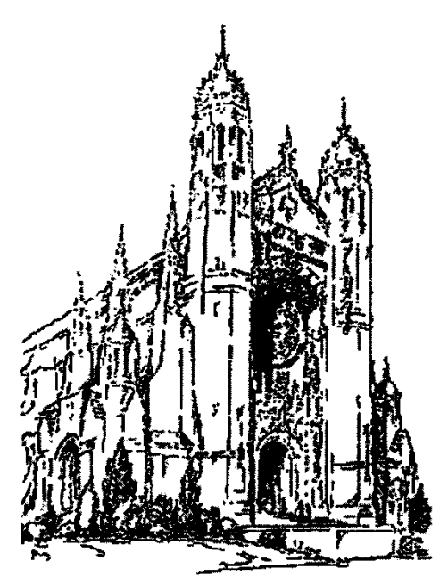
Our Lady, Queen of the Most Holy Rosary Cathedral