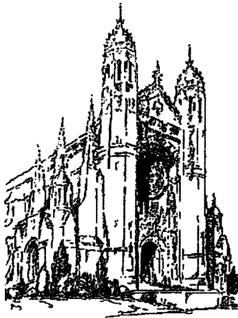
Our Lady, Queen of the Most Holy Rosary Cathedral